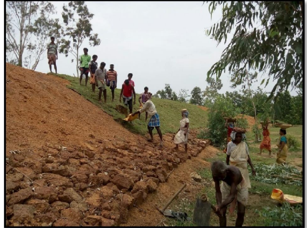
Spontaneous Participation of the local people for development of the Earthen Dam