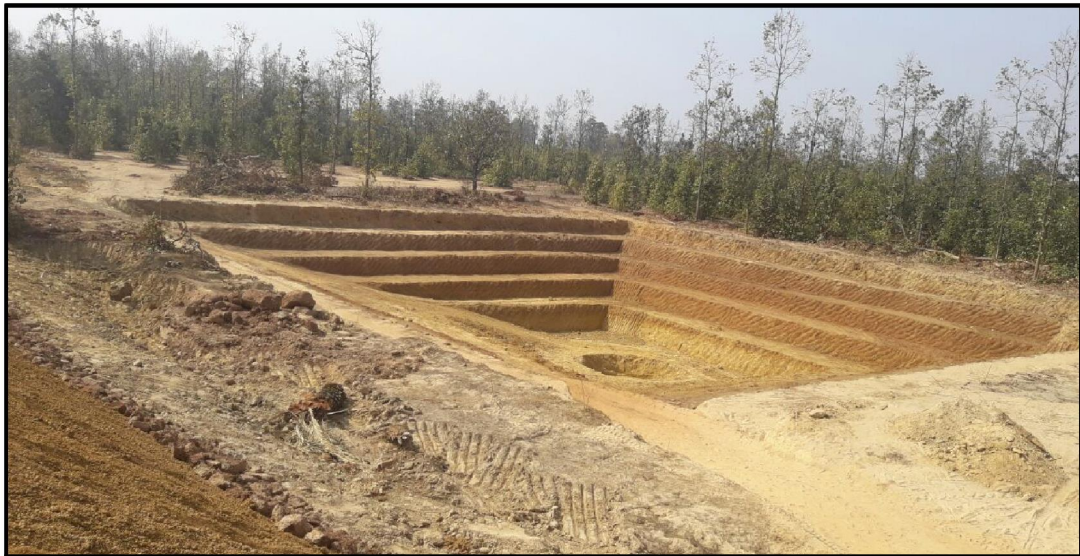
Quality of soil work during the construction of the Earthen Dam