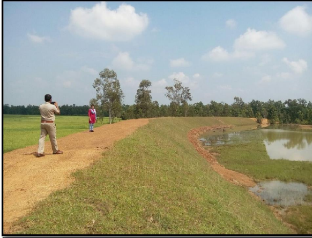
Lush green crop field irrigated from the stored water of the Earthen Dam.