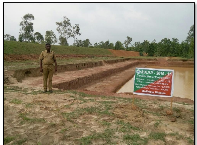
Preserver of the Earthen Dam is full of water, helping in ground water recharging