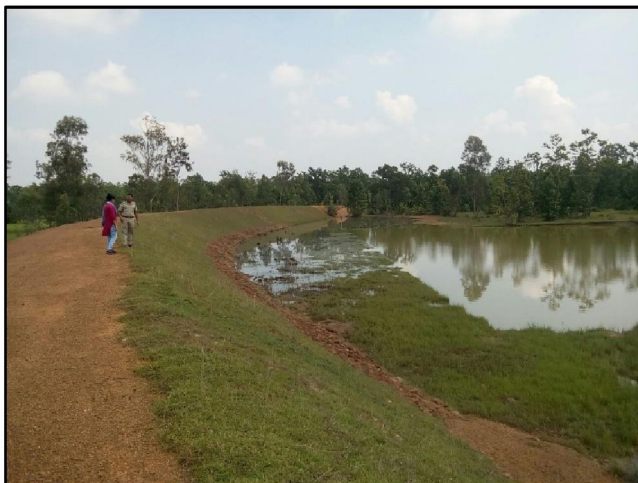
Panoramic view of the Earthen Dam with full of Water